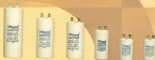
PRESS FIT PIN