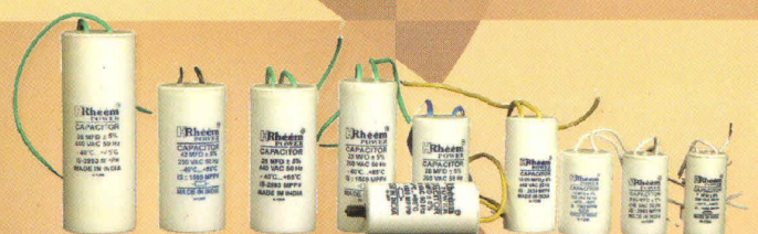
PRESS FIT WIRE